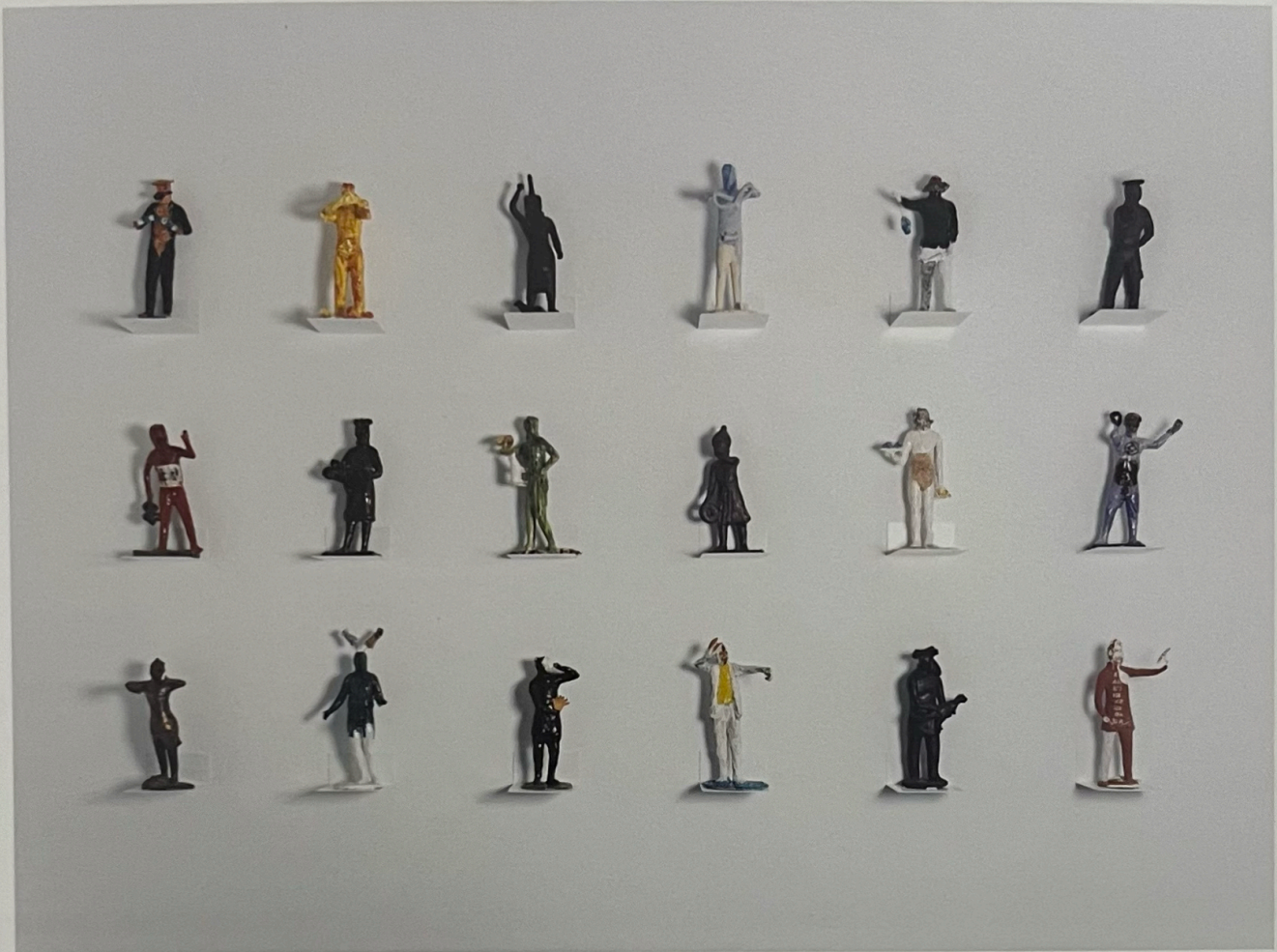
Votive Wall Paolo Porelli Italia 150x250x16 Terracota esmaltada y pintada